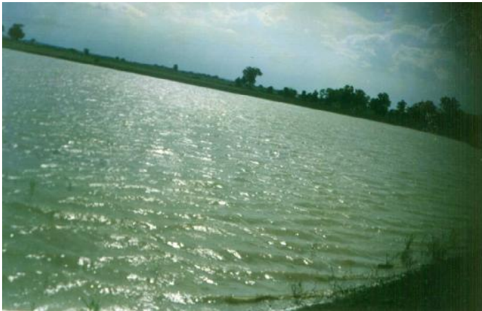
Earthen dam, Village Nittarri, Dist. Vidisha under RGM Watershed project